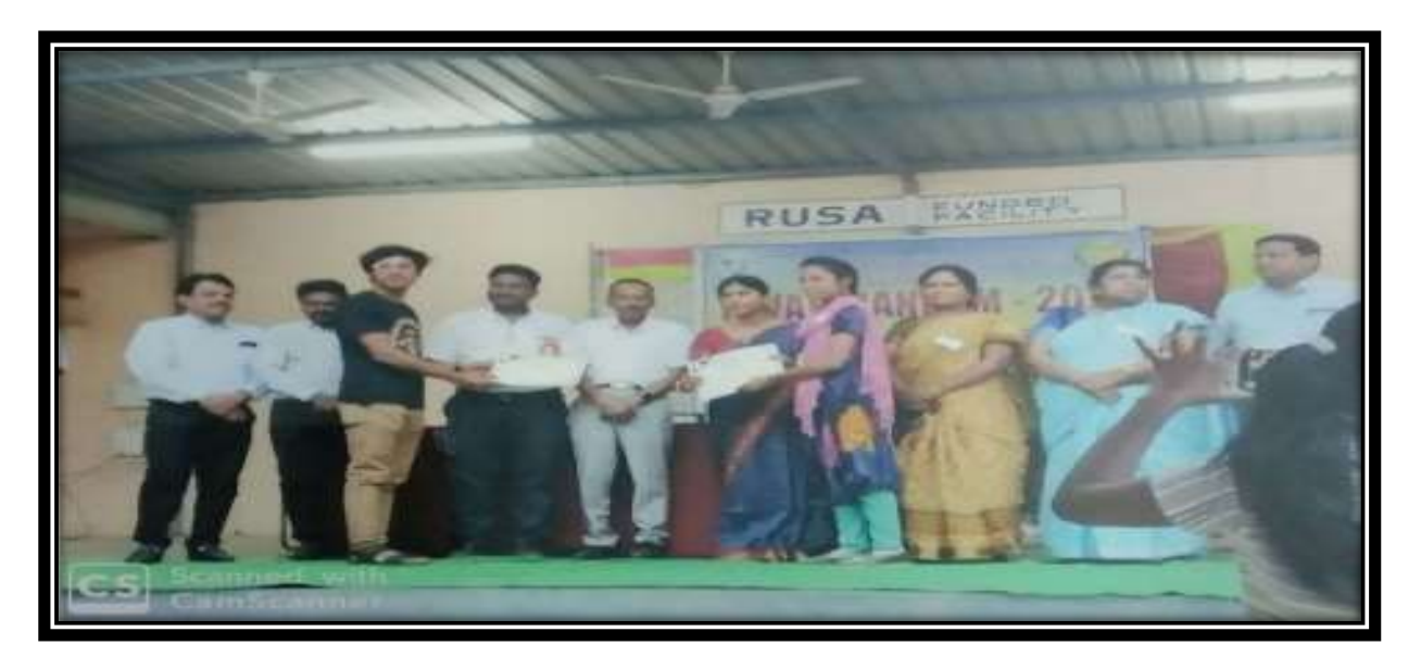
Cluster level competitions in Speed reading, Elocution, poetry writing and story writing in Hindi at Kakatiya Government College,Hanamkonda.