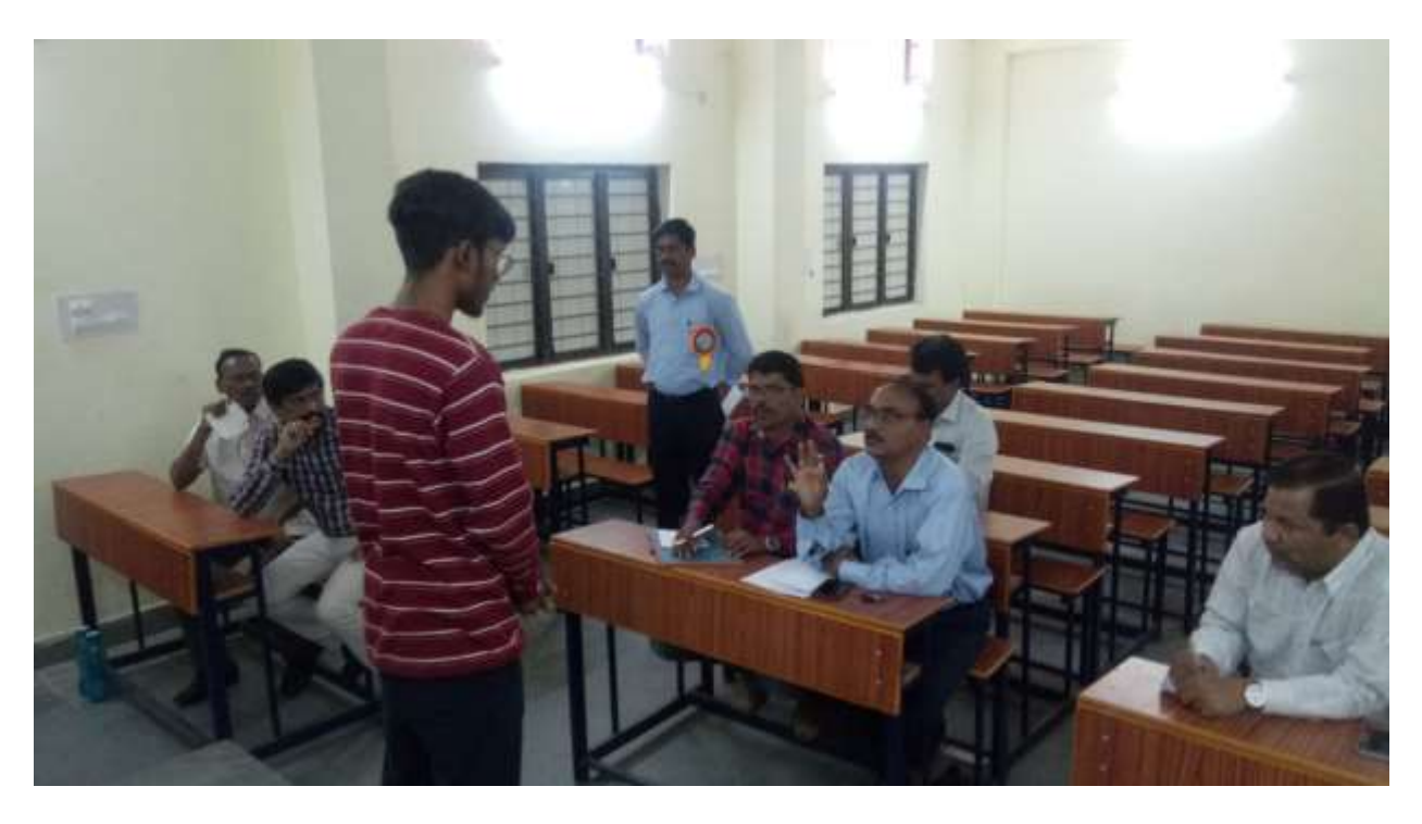
Debate Program on occasion of National Youth Day-2019