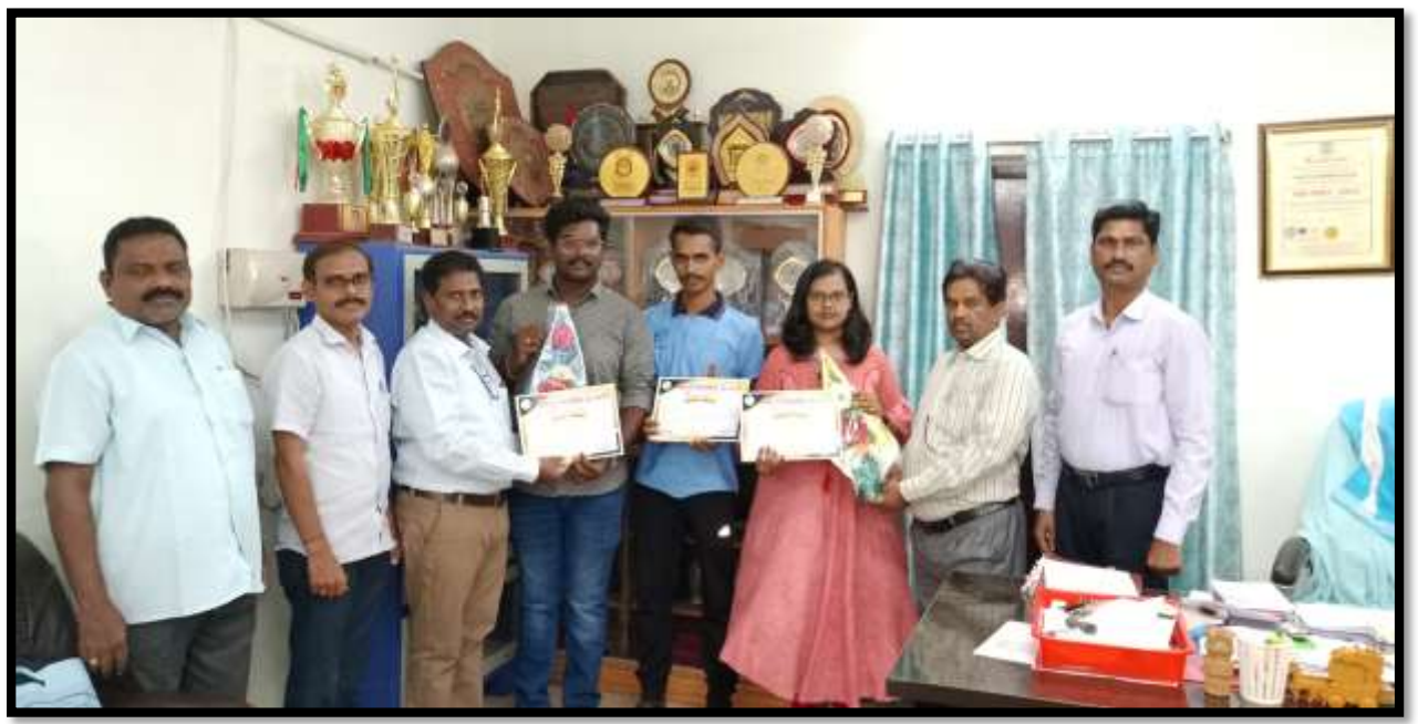
Felicitations to winners by the Principal