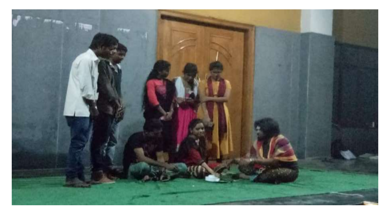
Our students performing skit on the Occasion of Independence Day in 2019 at University