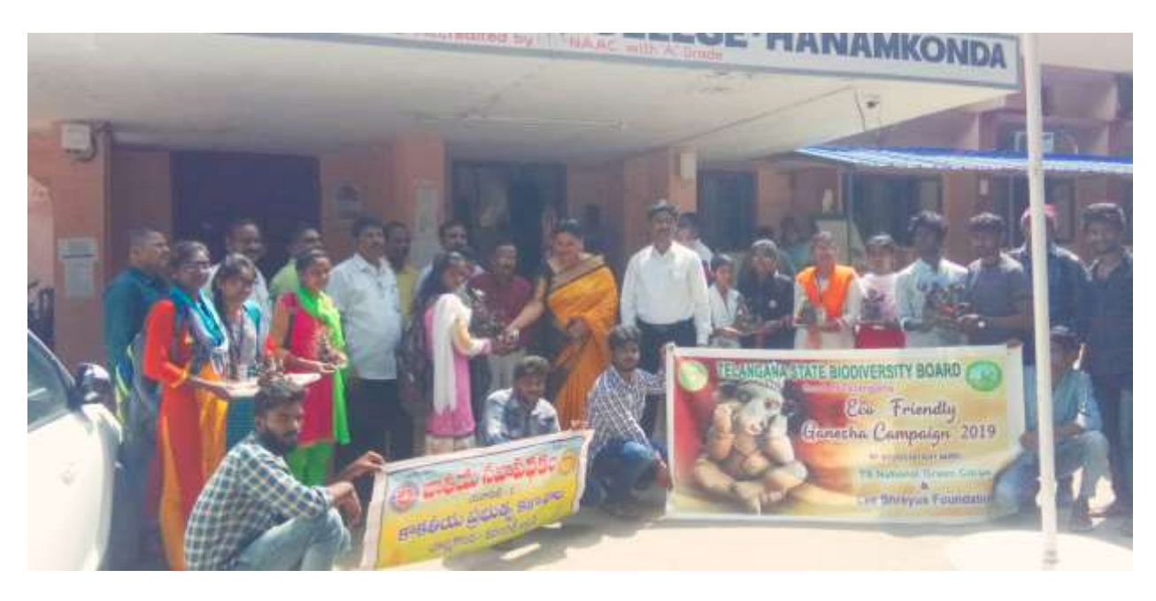
Clay Ganesha Awareness on August - 2019