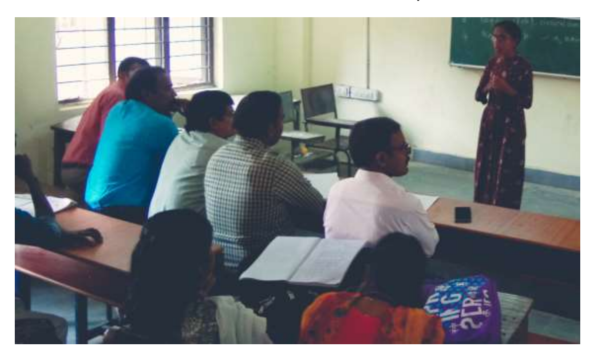
Elocution on the occasion of National Youth Day -2020