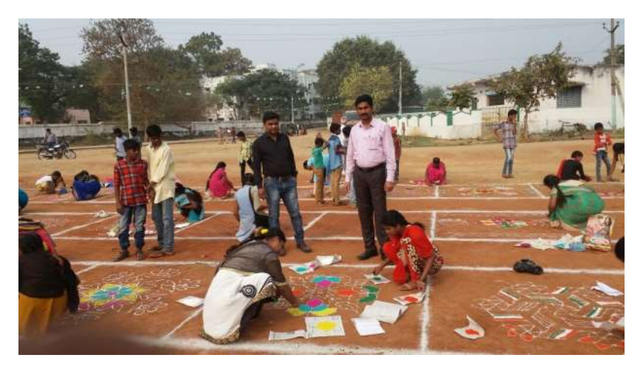
Rangoli event on the occasion of Sankranthi Festival on January-2019