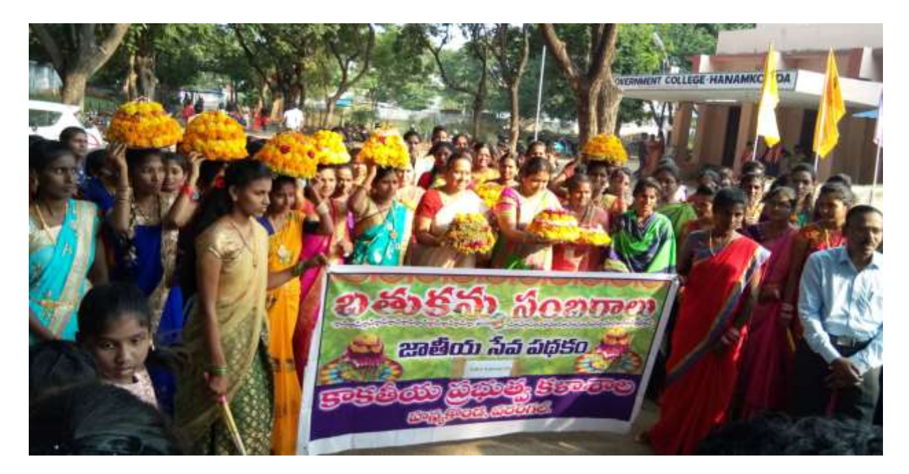
Bathukamma Festival Celebration on October – 2019