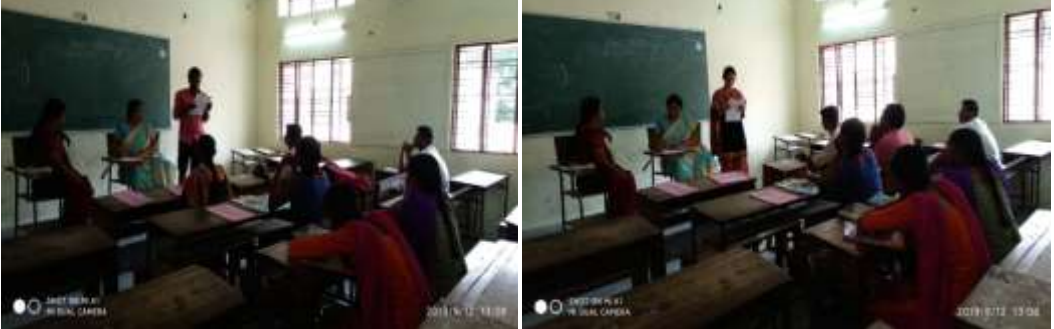
Rangoli event on the occasion of Sankranthi Festival on January-2020