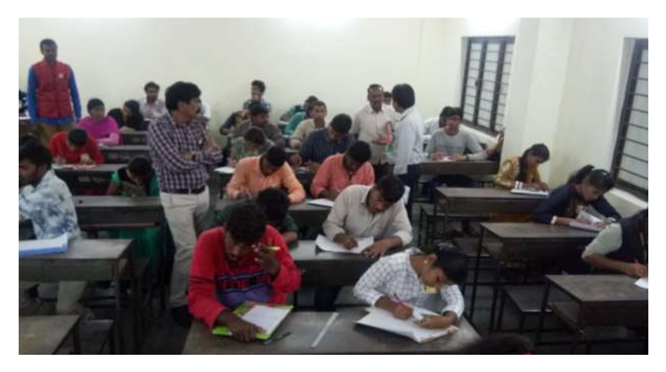
Essay Writing Competition on occasion of National Youth Day-2019